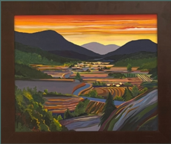
Brasstown Valley Looking West at Sunset