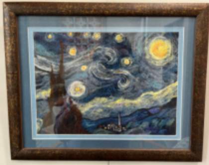
"Ode to Van Gogh"